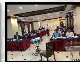
Day 2 – Tn224 Workshop