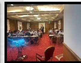
Day 1 – TN224 Workshop